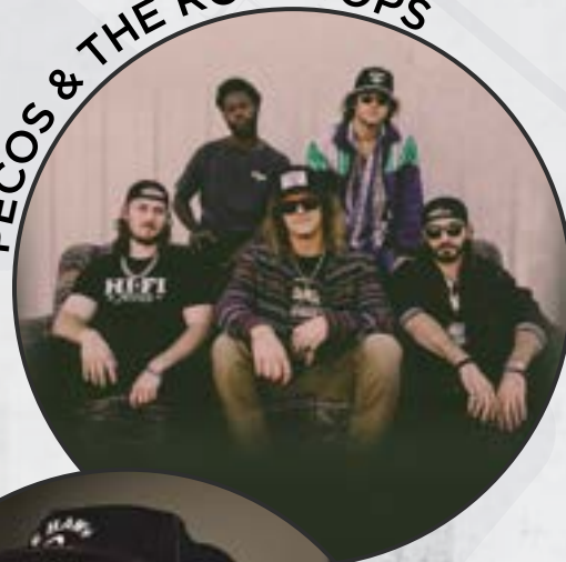
PECOS & THE ROOFTOPS